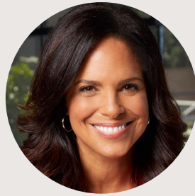
Soledad O'Brien Journalist and Starfish Media Group Founder